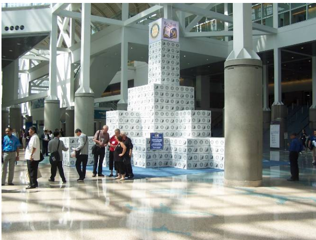
Photo to the left shows a stack of book boxes representing the number of books the convention hoped to collect.